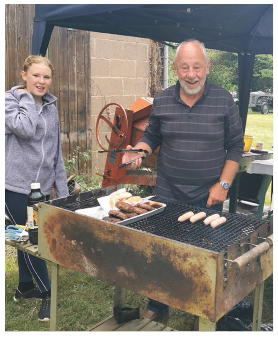
Volume 26 Issue 4 November 2024